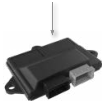
ELECTRONIC CONTROL UNITS

WARNING: the specifications/application data shown in our catalogs and data sheets are intended only as a general guide for the product described (herein). Any specific application should not be undertaken without independent study, evaluation, and testing for suitability.